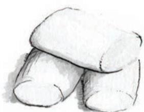
GNOCCHI (GF + VGN) + 2